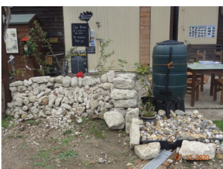
One of 3 rain gardens