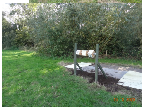
One of 4 mobile cube installations