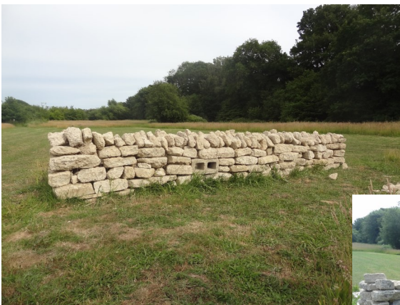
Dry stone (broken concrete) wall